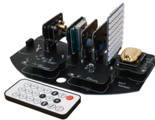
8 types of sensor modules provided for AIoT Home Plus (Option for AIoT Home PrimeX)