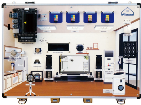
AIoT Home PrimeX