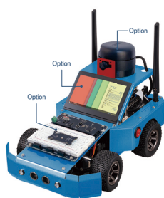
AutoCar III G