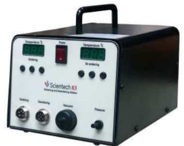
Soldering / Desoldering Stations