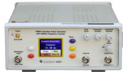
10 MHz AM / FM Function-Pulse Generators with 40MHz Frequency Counter