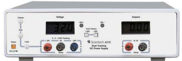
Dual Tracking DC Power Supply