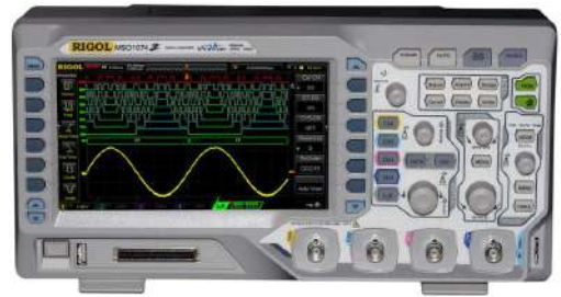
50MHz, 1GSa/s, 4CH Digital Storage Oscilloscope