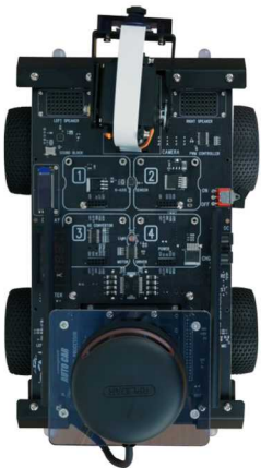
AIoT AutoCar Plus