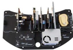
8 sensor modules provided in AIoT AutoCar Plus