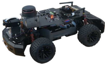
AIoT AutoCar PrimeX