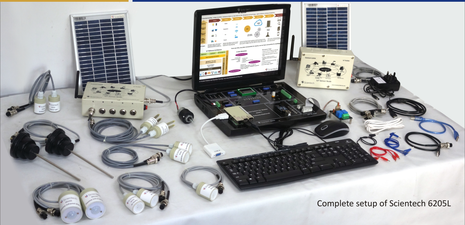
Complete setup of Sciencetech 6205L